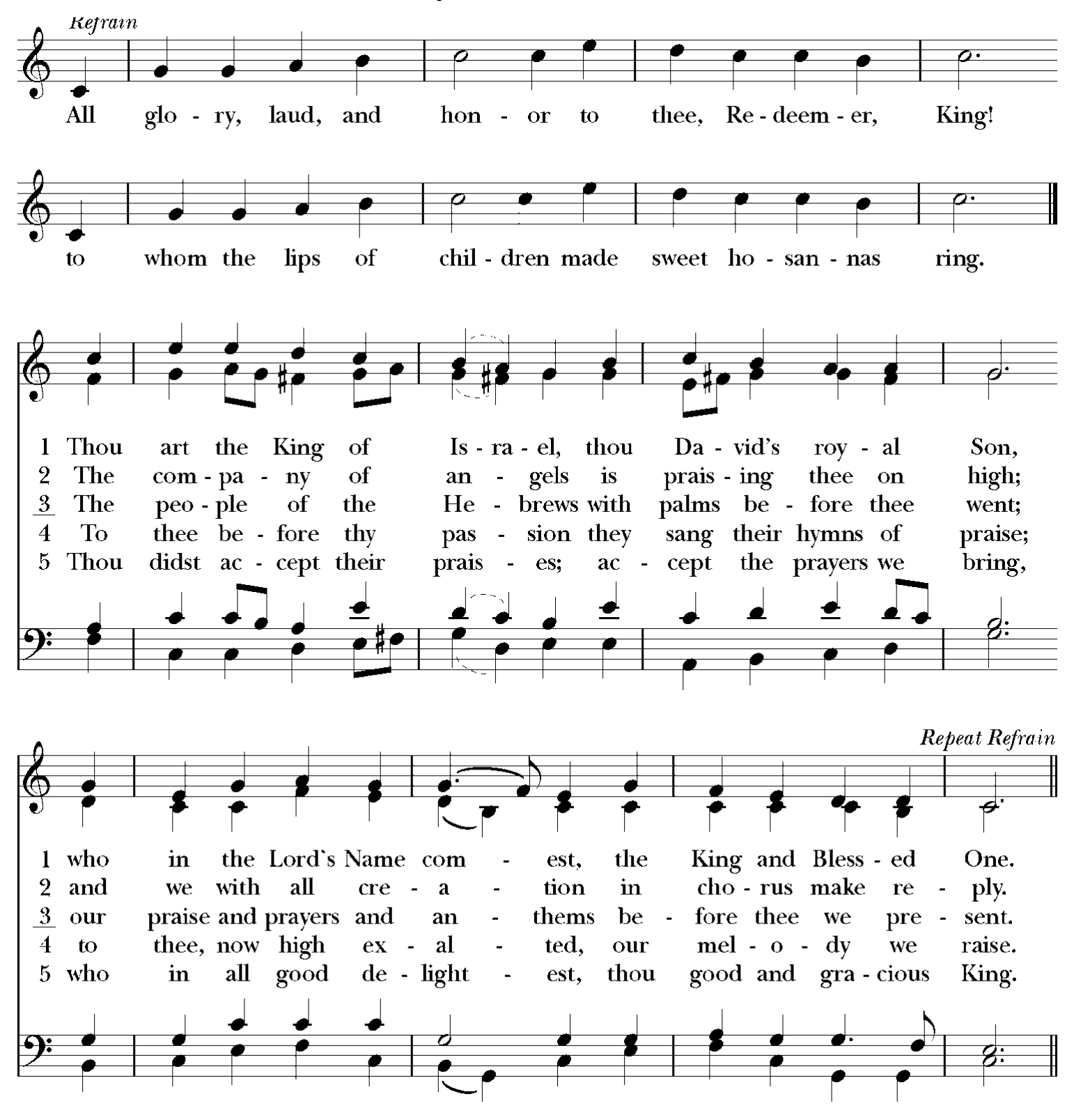
The stanzas may be sung by choir alone or alternately by contrasted groups; all sing the refrain.